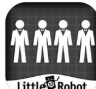
Operation Math Code Squad £2.99 (iOS) £2.69 (Google)